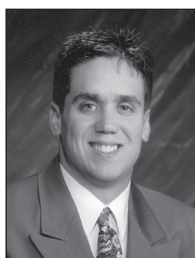
CLASS OF 1990