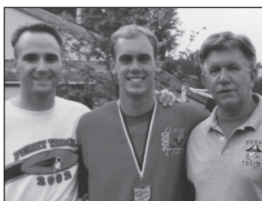
CLASS OF 2002