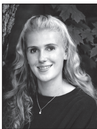
CLASS OF 1995